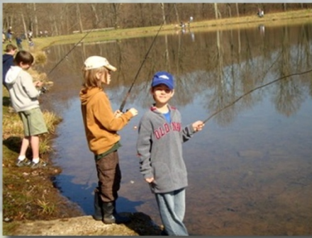
Bring the kids & the fishing rods!