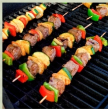
MENU: kabobs, salads, watermelon, cupcakes