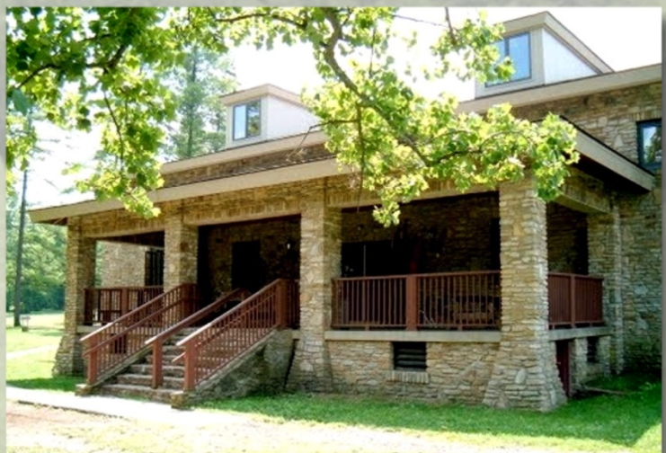
Rain or Shine - Dining Hall Is Ours for the Day

Spend the day at Camp Twin Echo! -or- Come for the Evening Conference & Barbecue